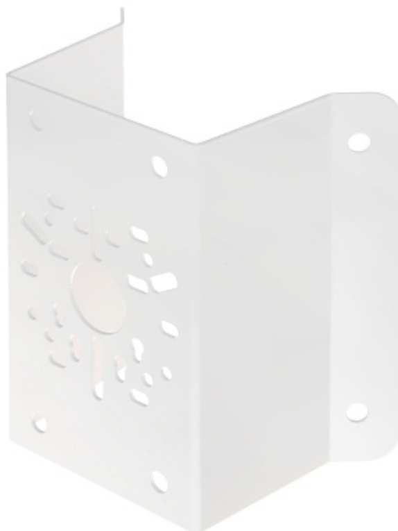
Camera bracket, which enables camera installation on the building corner.

The device must be secured against contact with caustic, staining and viscous fluids.