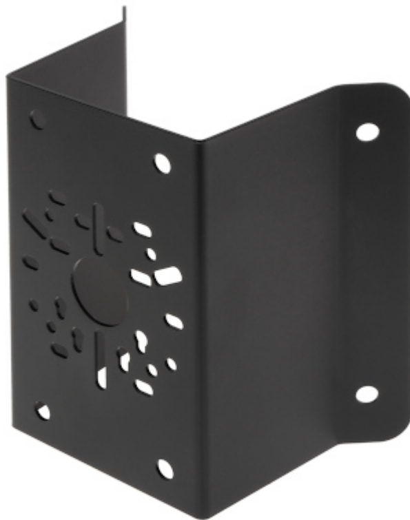
Camera bracket, which enables camera installation on the building corner.

The device must be secured against contact with caustic, staining and viscous fluids.