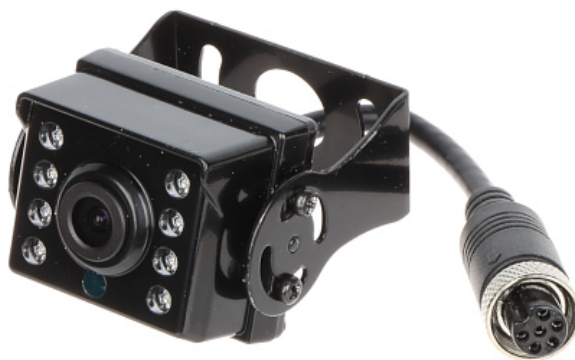
Mobile IP camera equipped with M12, 6-pin - code A connector, providing image in maximum resolution Full HD, 1080p.

To return a worn-out product, use a collection and disposal system of this type of equipment or contact a seller from whom it was purchased. He will then be recycled in an environmentally-friendly way.