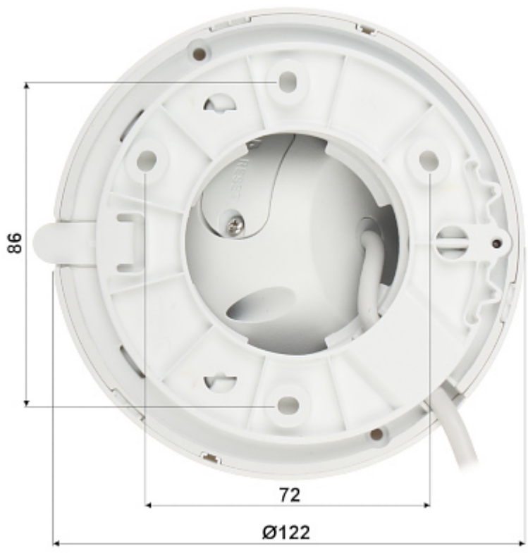
See how to initialize DAHUA cameras: