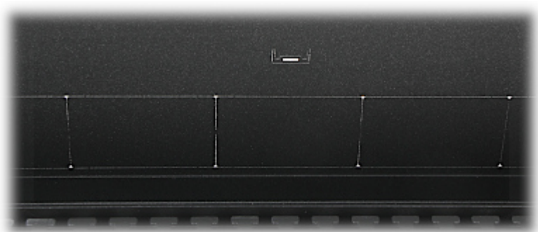
Holes for fan coolers: