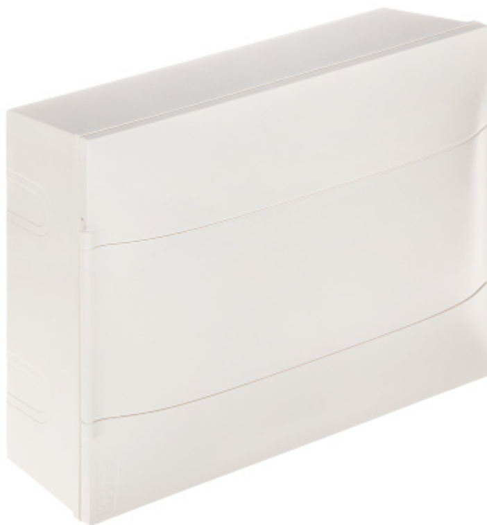
1-row 12-modular surface-mounting distribution electric cabinet.

The device must be secured against contact with caustic, staining and viscous fluids.