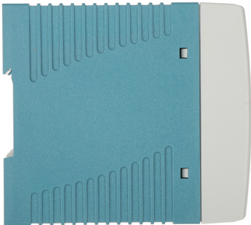
Rear panel (DIN rail installation):