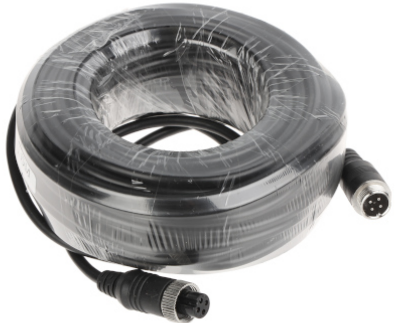
Connection cable terminated with socket and plug M12 4-pin.

The device must be secured against contact with caustic, staining and viscous fluids.