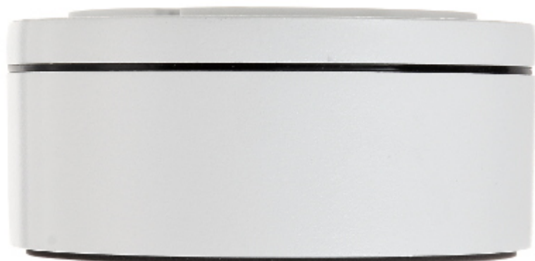
View without the front cover: