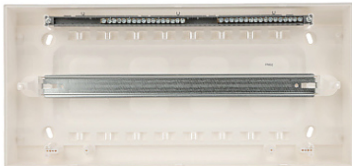
Connecting terminals view: