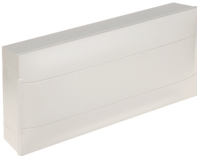
1-row 22-modular surface-mounting distribution electric cabinet.

The device must be secured against contact with caustic, staining and viscous fluids.