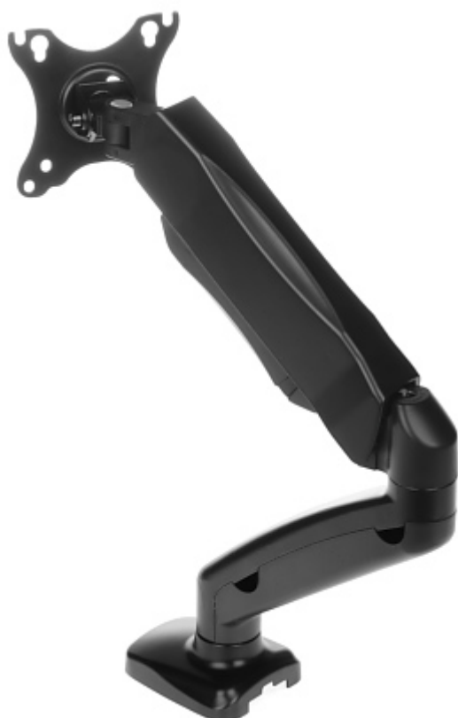
Gas spring adjustment: