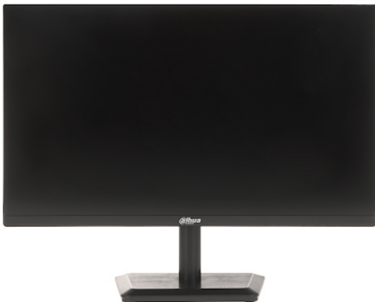
OSD menu control keys: