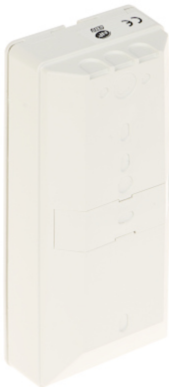
Detector inner view: