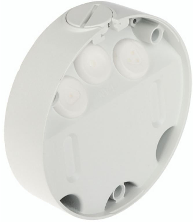
Camera and bracket dimensions: