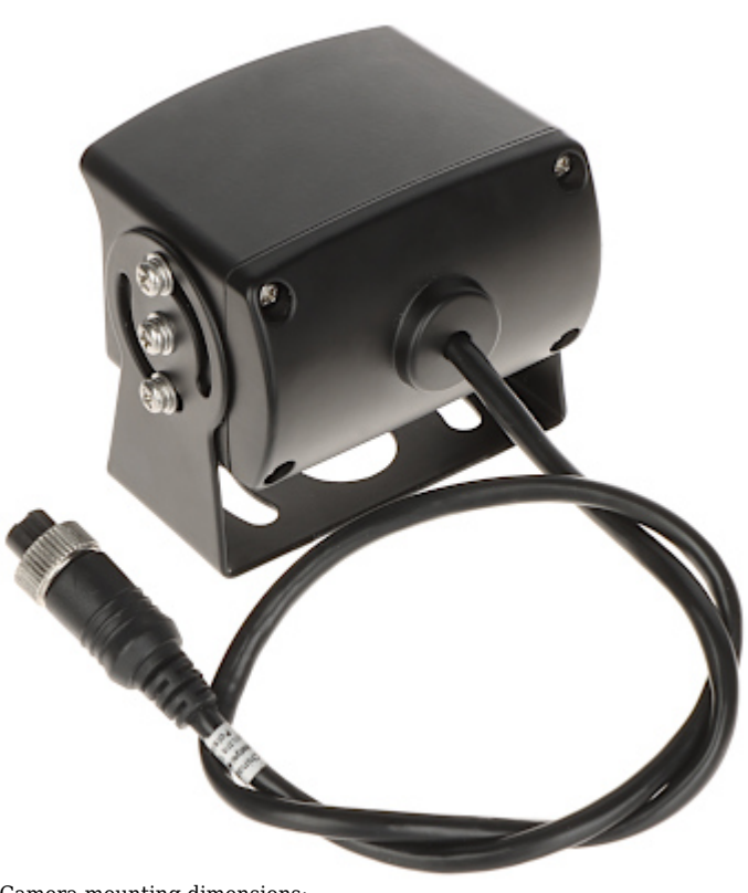
Camera mounting dimensions:

Code: ATE-CAM-IPC680 IP MOBILE CAMERA ATE-CAM-IPC680 - 1080p 2.8 mm AUTONE