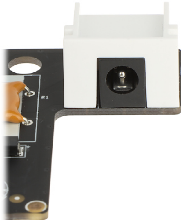
In the kit: