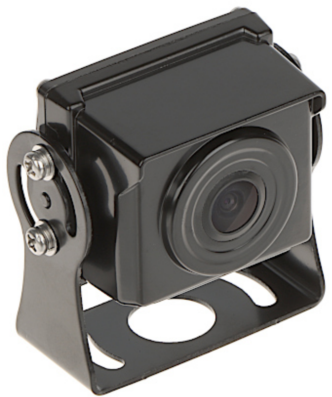
Small dimensions camera: