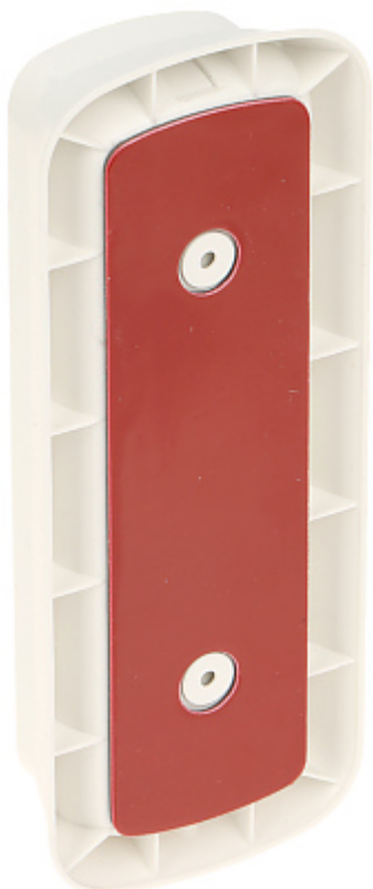
Rear view (place for batteries):