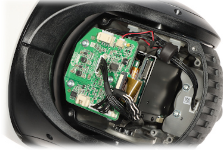
Micro SD card slot is located inside the camera: