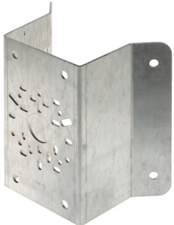
Camera bracket, which enables camera installation on the building corner.

The device must be secured against contact with caustic, staining and viscous fluids.