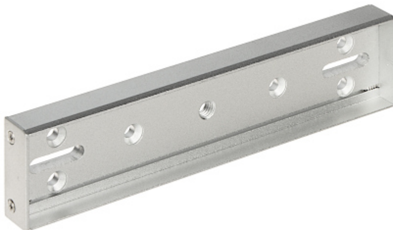
I-type mounting bracket for fire doors.

The device must be secured against contact with caustic, staining and viscous fluids.