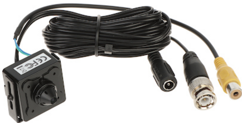
Camera is very small: