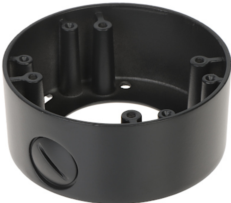
View of the ceiling mounting side: