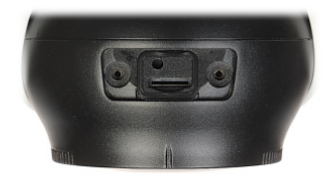
Camera is out from clamping ring: