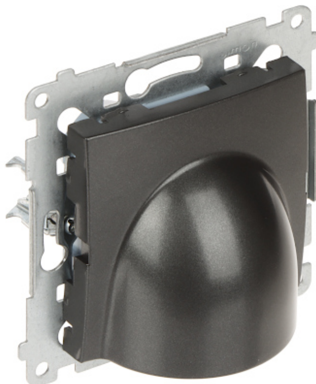
Cable outlet for temperature probe.

The device must be secured against contact with caustic, staining and viscous fluids.