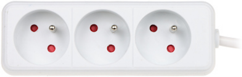
CEE 7/7 plug: