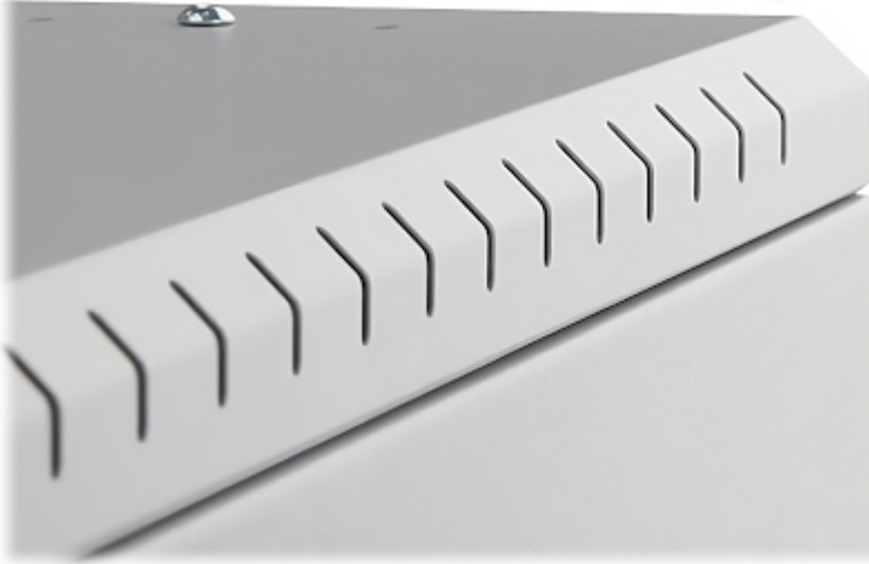
Blind cable entries: