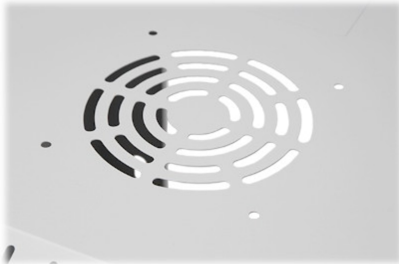
Ventilation holes on the front of the housing: