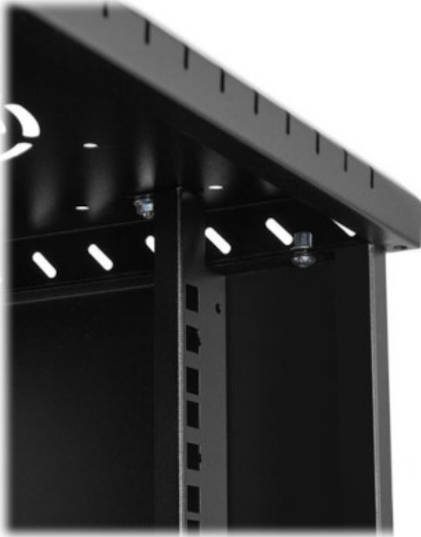
Ventilation holes on the front of the housing: