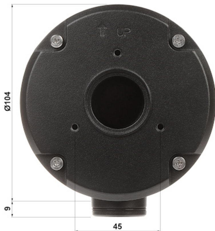
View of the ceiling mounting side: