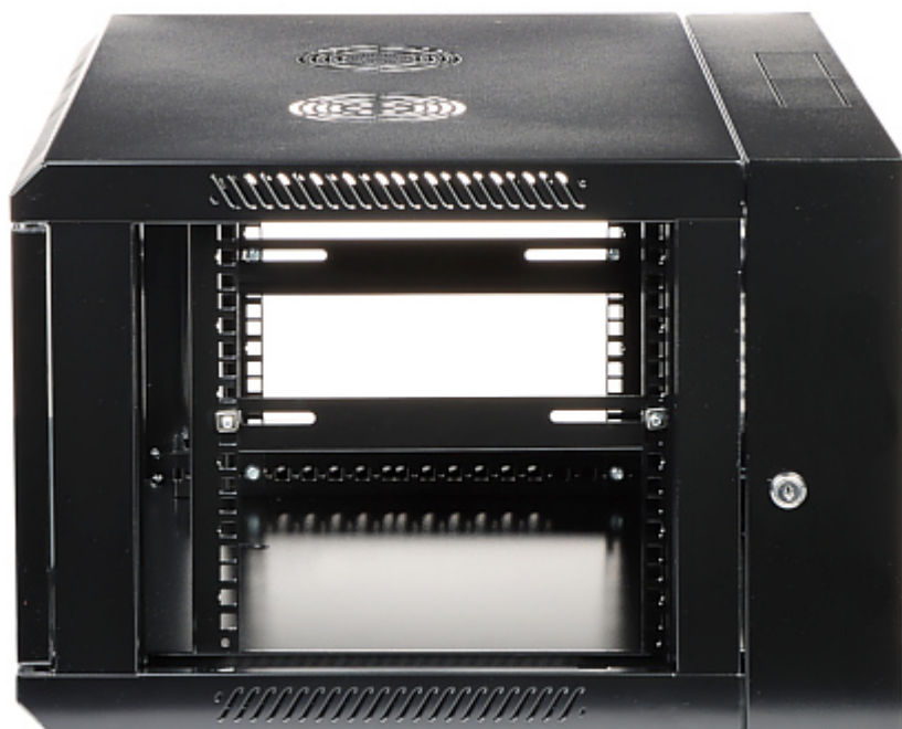
Holes for fan coolers: