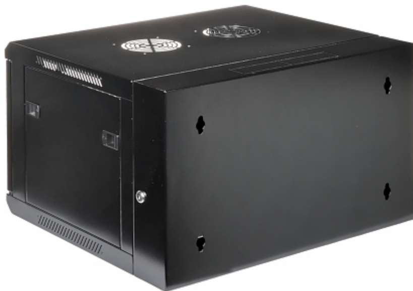
The cabinet with rear door open: