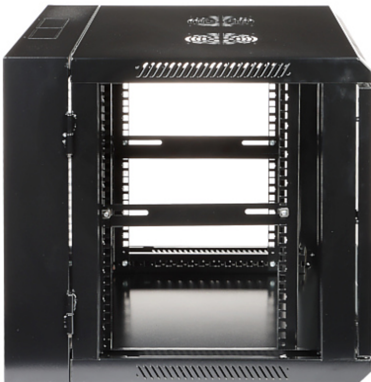
Holes for fan coolers: