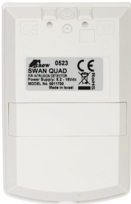
Detector inner view: