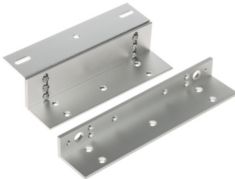
Z-bracket and L-bracket set for the JS-280W electromagnetic lock with load capacity of 280 kg.

The device must be secured against contact with caustic, staining and viscous fluids.