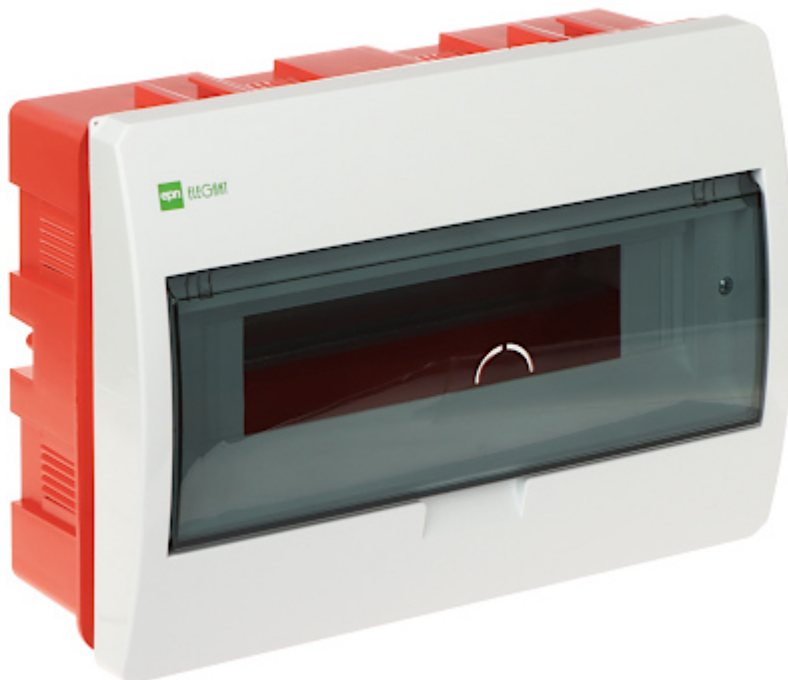
1-row 12-modular flush-mounting distribution electric cabinet.

The device must be secured against contact with caustic, staining and viscous fluids.