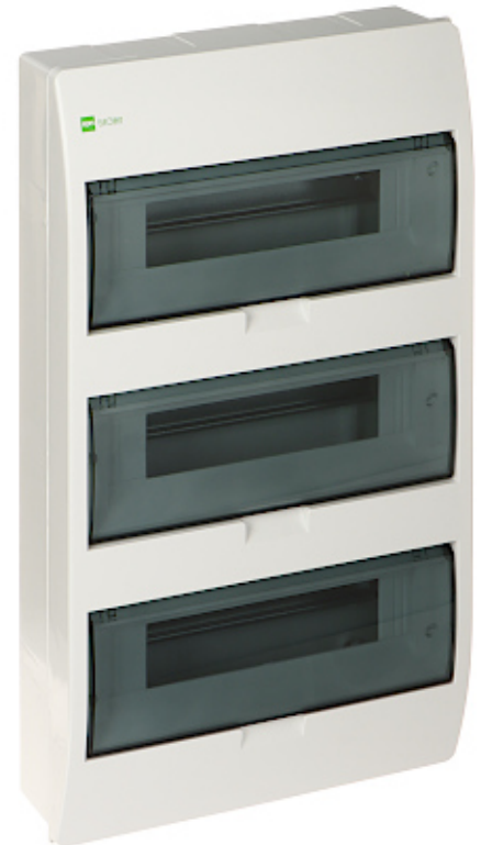
3-row 36-modular surface-mounting distribution electric cabinet.

The device must be secured against contact with caustic, staining and viscous fluids.