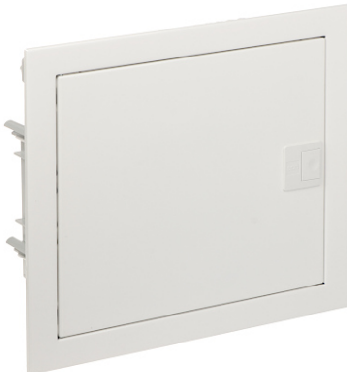
1-row 12-modular flush-mounting distribution electric cabinet.

The device must be secured against contact with caustic, staining and viscous fluids.