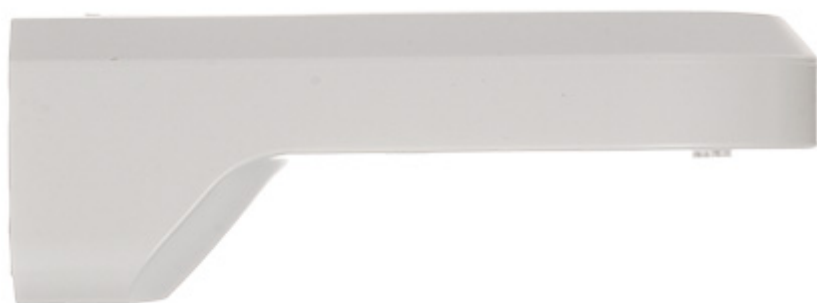
Elements of the bracket: