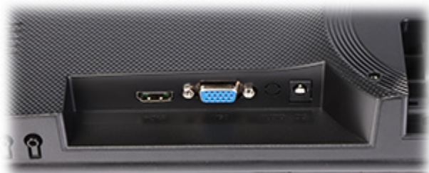
In the kit: