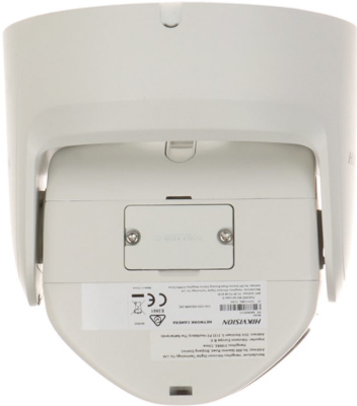
Memory card slot and "Reset" button: