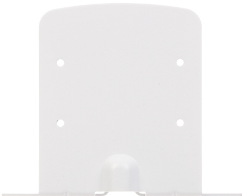
View of the ceiling mounting side: