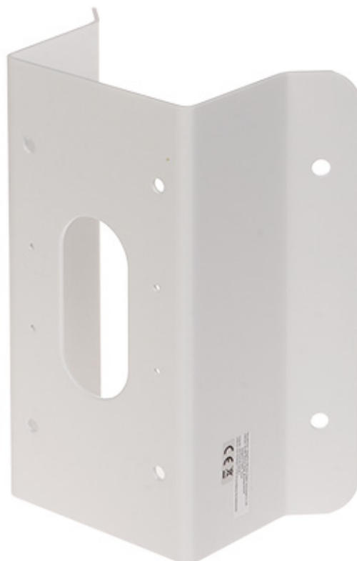
Camera bracket, which enables camera installation on the building corner.

The device must be secured against contact with caustic, staining and viscous fluids.