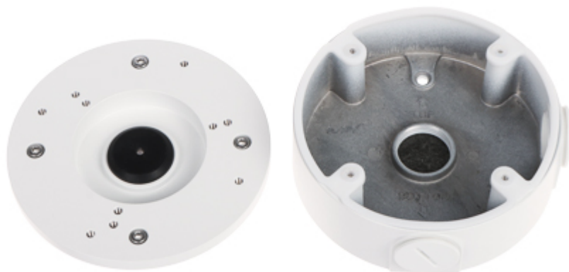
Wall mounting side view: