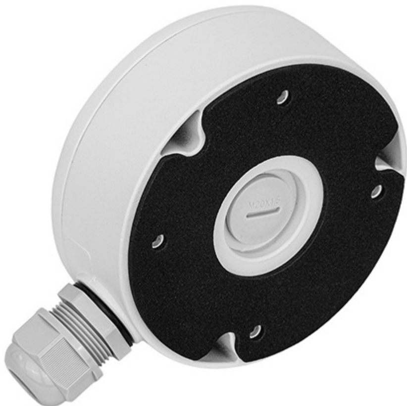
View without the front cover: