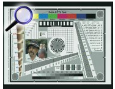
For VGA 1280x1024 resolution