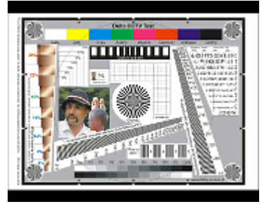
Original image at VGA side