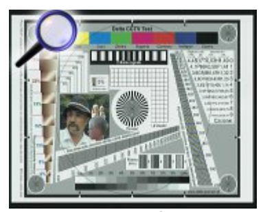
For VGA 1024x768 resolution