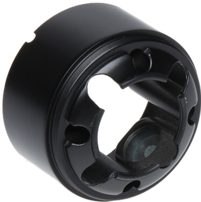
Bracket with mounted camera: