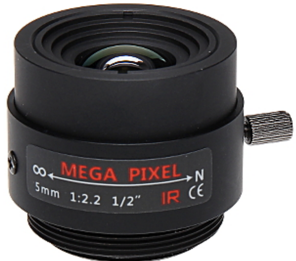
Fixed-focal lens with CS mounting type designed to megapixel cameras.

The device must be secured against contact with caustic, staining and viscous fluids.