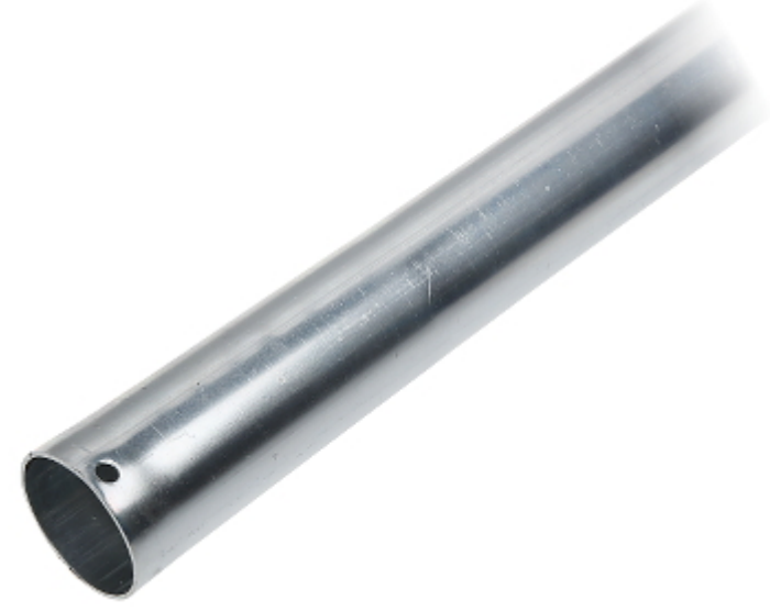
Two sections combined:

The embossing of the mast matched to the cone-shaped tip: