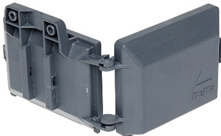
Method of mounting: