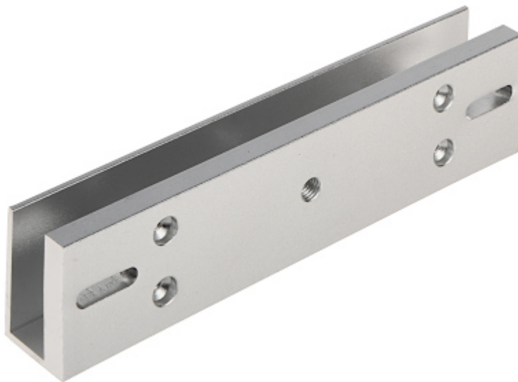
U-type mounting bracket for glass doors.

The device must be secured against contact with caustic, staining and viscous fluids.