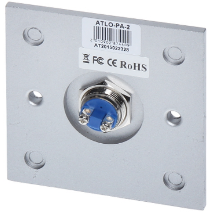
In the kit: